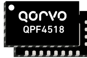
24 Pin 5x3 mm QFN Package

The QPF4518 integrates a 5 GHz power amplifier (PA), single pole two throw switch (SP2T) and bypassable low noise amplifier (LNA) into a single device.